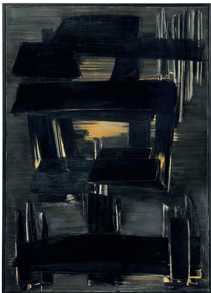
Pierre SOULAGES Peinture 162 x 114cm, 29 août 1958 162 x 114 cm Signed bottom right 1958

This is a ground-breaking exhibition which will be sure to surprise! Most of the works on show are privately owned and are therefore unknown to the art market and the general public. A dozen or so iconic paintings will be on display, including some executed on a spectacularly large scale, as well as some works on paper including an exceptional example of 'walnut ink' work. This medium was of particular interest to Soulages due to the contrasts between opacity and transparency it creates. Collectors and the general public can try their hand at the art of distinguishing between works created in say 1952 and one painted in 1957, as the way in which Soulages composed his work, his hand movements and the techniques he used changed over the course of the 1950s.