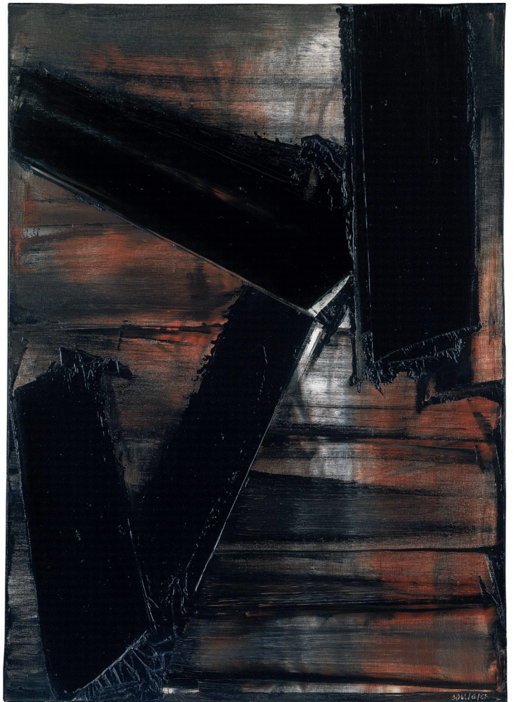
Pierre SOULAGES Peinture 92 x 65 cm, 12 août 1959 Oil on canvas - 1959 Signed bottom right

Its participation in art fairs, the contribution it has made to museum exhibitions and above all, its exacting and impeccable taste have won it an international reputation and enabled it to build long-lasting relationships with the collectors it serves.